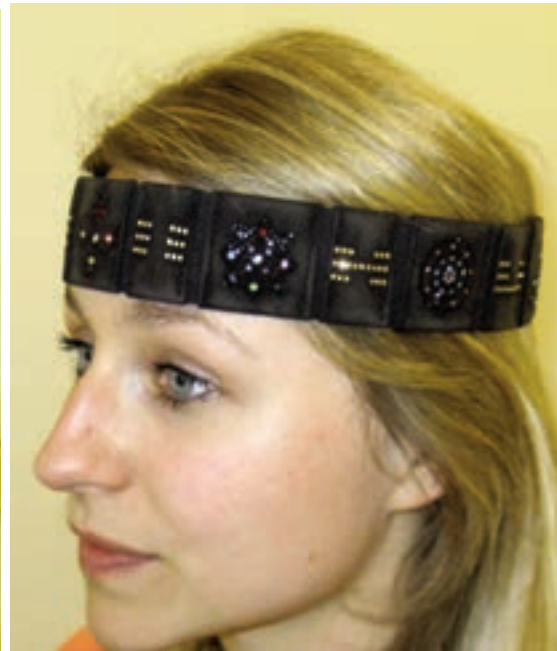
Crystal Meditation Band (CMB)